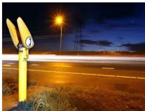
Figure 2. AA telephone booths along Dutch highways, common in the 1990s.

Consider Figure 1, a billboard from a Dutch 1990s campaign for IBM (discussed in Forceville, 1996). We see a more or less vertical object with a protrusion at the top end, painted in stark blue-and-white stripes, standing next to what appears to be a deserted rural road. Thanks to the striking visual resemblance with the IBM logo we probably guess that we need to construe a metaphor with IBM as the target and this blue-and-white object as the source. But what is it? Well, it is an open-air telephone booth, at the time standardly occurring at regular intervals along Dutch motorways, via which a car-driver in trouble could contact the AA to ask for assistance (see Figure 2). Presumably the idea underlying the metaphor is that just as the AA provides help for unfortunate car drivers, so does IBM to those using its systems – wherever they may be located. But clearly such an interpretation is only open to those who recognize the source domain in the first place. To people from another culture this object may be as baffling as some of those in a Magritte painting. Actually, since such telephone booths have nowadays become much rarer, thanks to the widespread possession of mobile phones, I suspect that many younger Dutch people, too, will be puzzled by it.