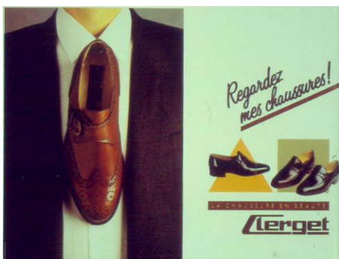
Figure 6. The metaphor SHOE IS TIE, as discussed in Forceville (1996).

Now presumably both Donkey and the jealous architect deliberately "subverted" the metaphor, performing what Stuart Hall (1980) would call an "oppositional reading." It is more serious when people automatically or intuitively access unwanted features of the source for mapping onto the product domain. Let us consider three advertisements sporting visual metaphors that might misfire when interpreted by audiences with different (sub)cultural backgrounds.