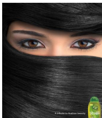
Figure 7. Hint at the metaphor BLACK HAIR IS NIQAB. Provenance and date unknown.